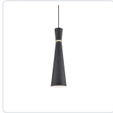
493206-BK/GD Black with Gold detail