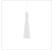
493206-WH/GD White with Gold detail