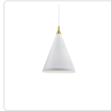
492716-WH/GD White with Gold detail