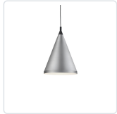
492716-BN/BK Brushed Nickel with Black detail