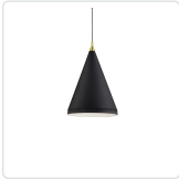
492716-BK/GD Black with Gold detail