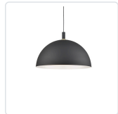
492332-BK/GD Black with Gold detail