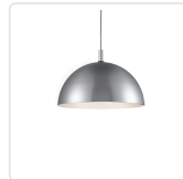
492332-BN/BK Brushed Nickel with Black detail