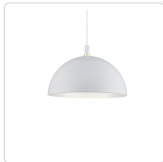
492332-WH/GD White with Gold detail