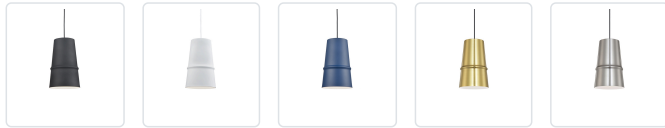
492208-BK Black 492208-WH White 492208-IB Indigo Blue 492208-GD Gold 492208-BN Brushed Nickel