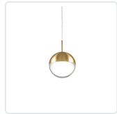
402801BG-LED Brushed Gold