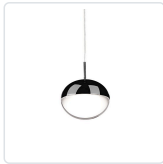
402801BC-LED Black Chrome