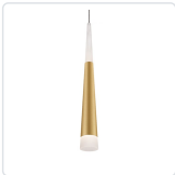
402501BG-LED Brushed Gold