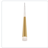
402501BG-LED Brushed Gold