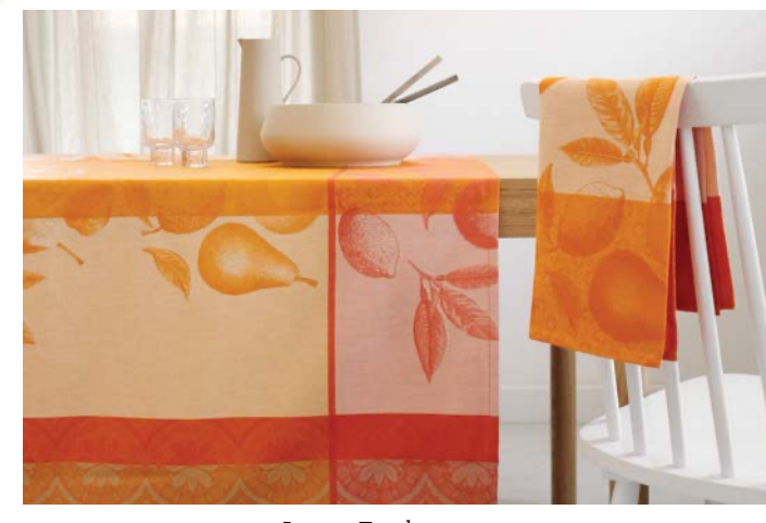
Artisan Touches The Arriere-Pays cotton tablecloth is a delicate weaving of local fruits, geometric and ornamental patterns. le-jacquard-francais.com

Hoppers: The Cookbook Published by Hardie Grant Transporting you to the tropical warmth of Sri Lanka with signature recipes and exploring the dishes, places and people that inspired them. powells.com