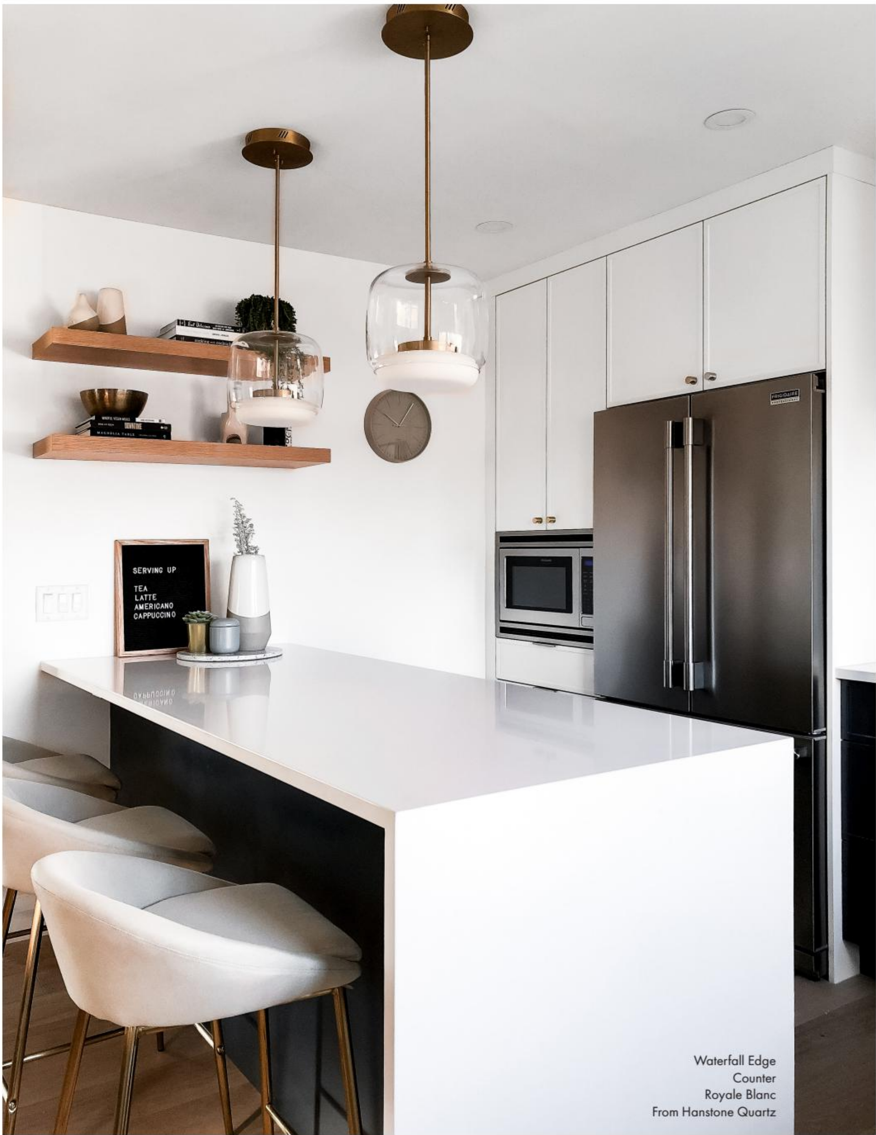
Waterfall Edge Counter Royale Blanc From Hanstone Quartz