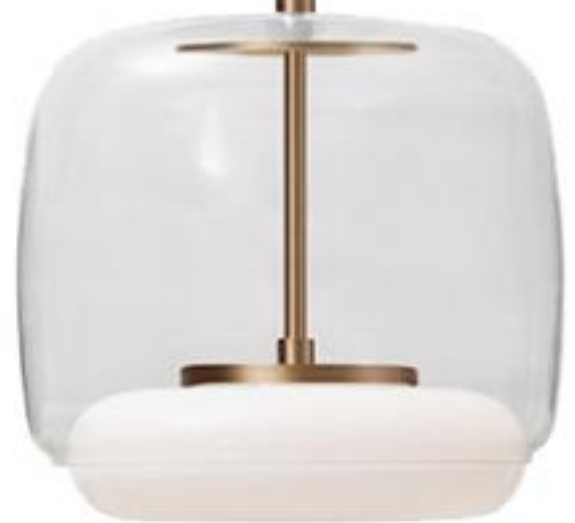
Island pendants from KUZCO LIGHTING offer an airy feel while still providing functional light.