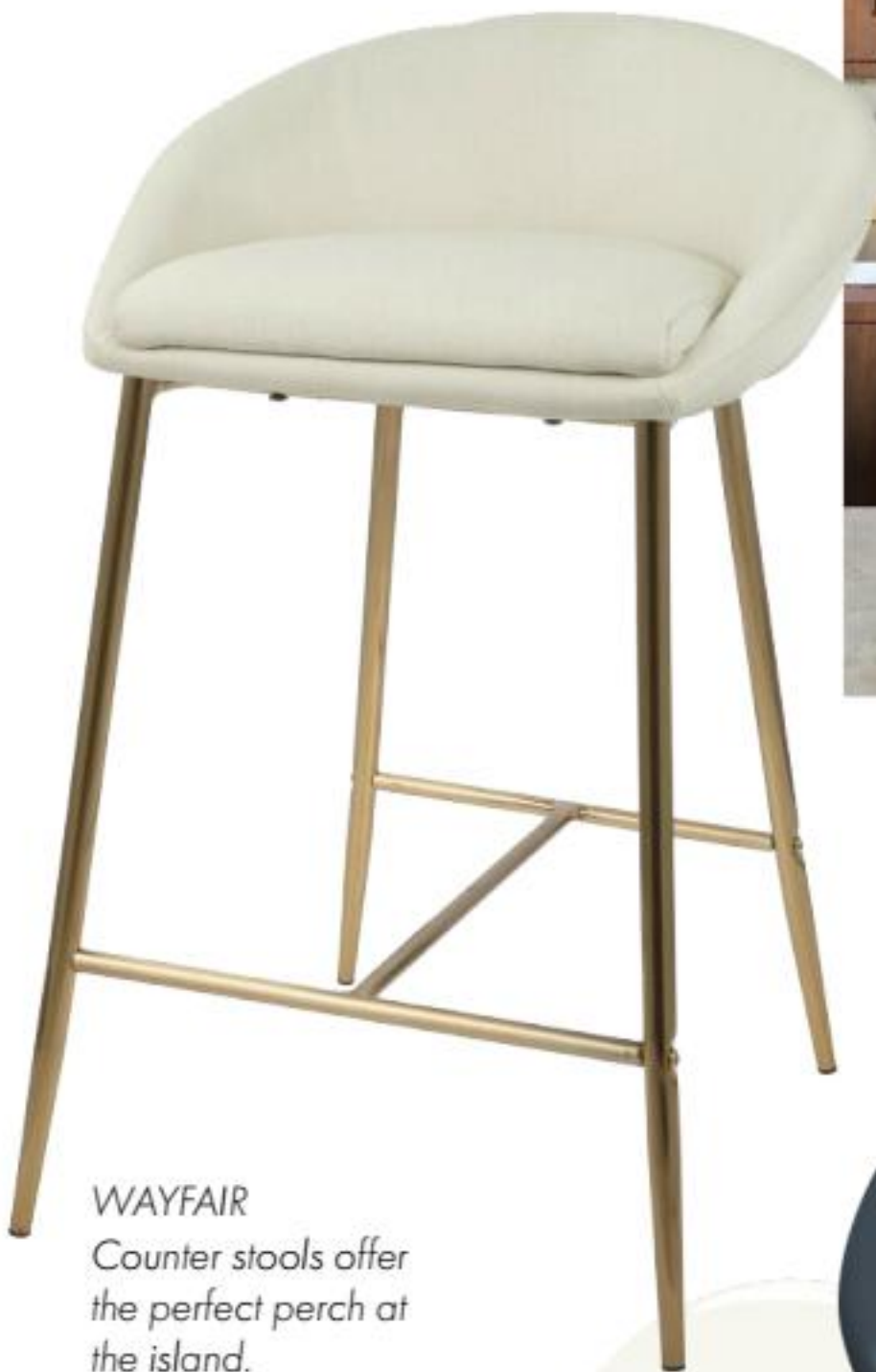
WAYFAIR Counter stools offer the perfect perch at the island.