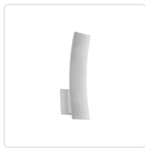
WS8016-BN Brushed Nickel