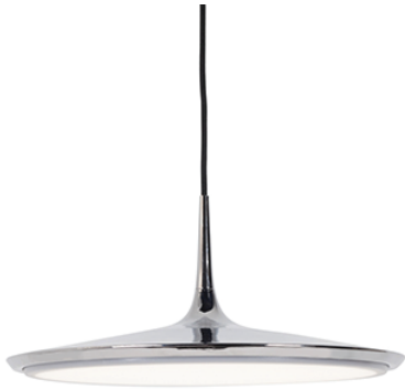
CH - Chrome