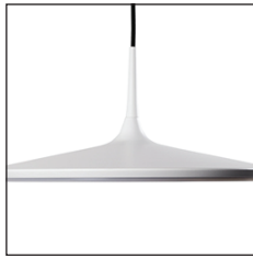
WH - White