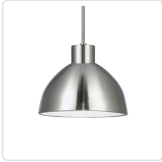
PD1709-BN Brushed Nickel