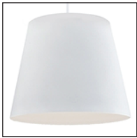
WH - White