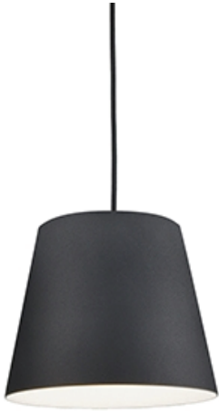
BK - Black