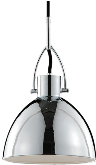
CH - Chrome